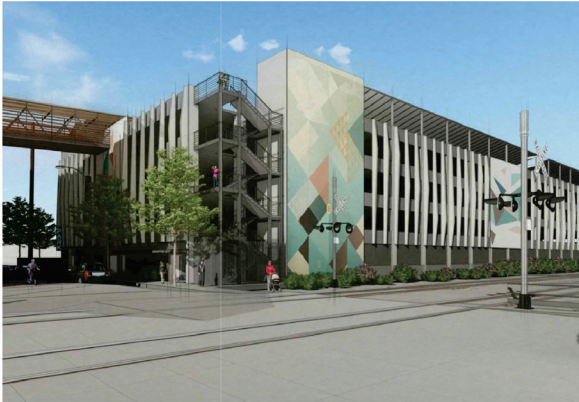
PREVIOUS CORNER SKETCH

I reviewed the proposed changes to the parking structure. - see sketch illustrations below. Major changes include: