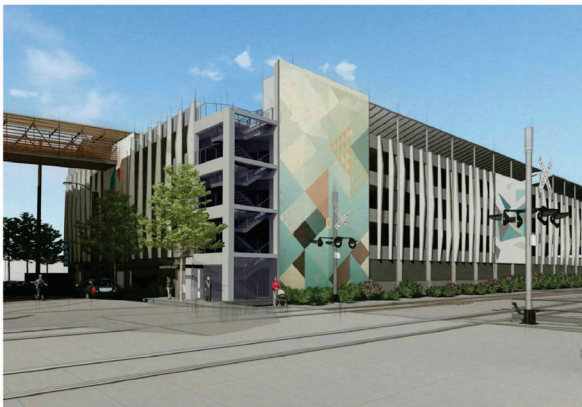
PROPOSED CORNER SKETCH